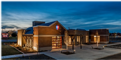
ERHC Main Health Center, Established 2014

NEW TERRITORY | Over the years, ERHC has received many invitations to replicate its groundbreaking practice model in sister Pacific Northwest communities, from Anchorage to Seattle to Salt Lake City. Based on the unwavering interest, dedication to member wellness, and health savvy demonstrated by emergency agencies in Spokane and Coeur d'Alene, ERHC established its first-ever expansion clinic in the Northeastern Washington/Northern Idaho region in early 2025.